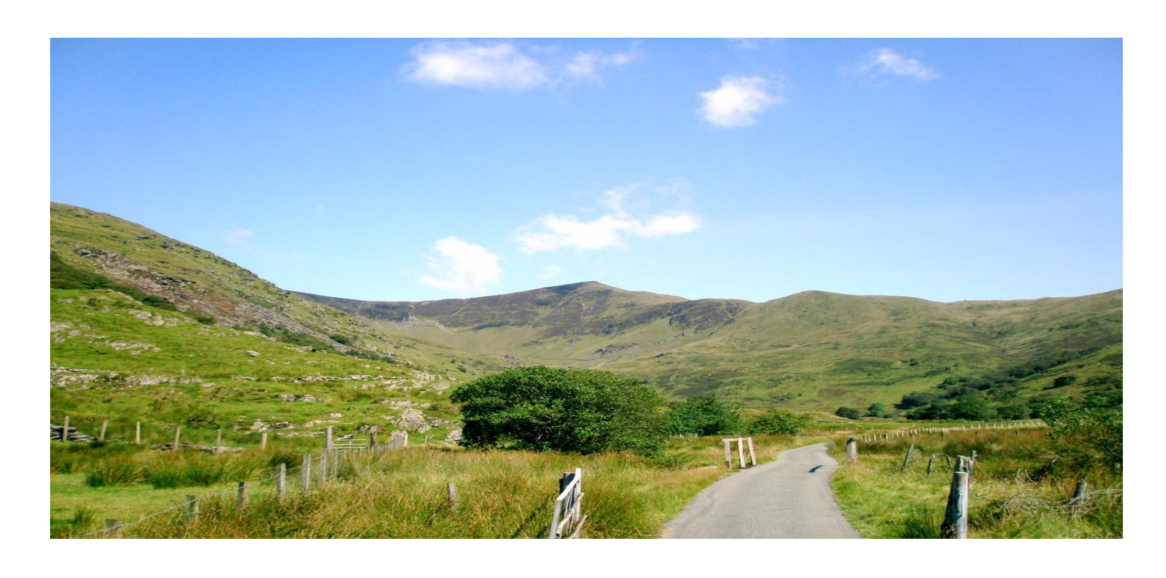
Prynhawn da - Good afternoon!